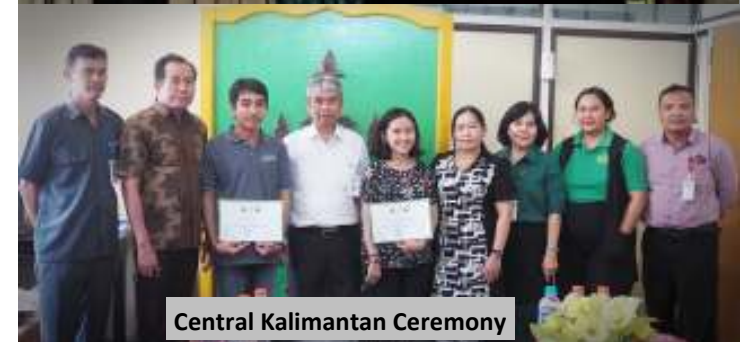
Central Kalimantan Ceremony