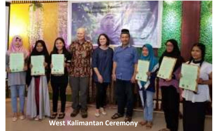
West Kalimantan Ceremony

OURF thanks our Indonesian partners: Orangutan Information Centre in Medan, Yayasan Palung in Ketapang, and now Borneo Nature Foundation in Palangka Raya for implementing this program.