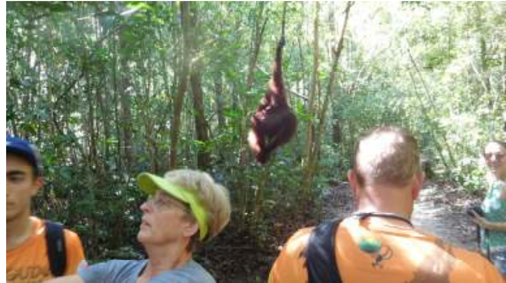
Ecotourists at an orangutan feeding station for public viewing