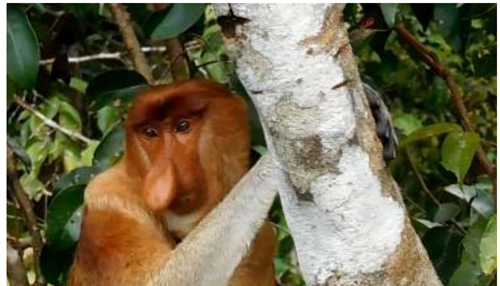
An adult male proboscis monkey near the river