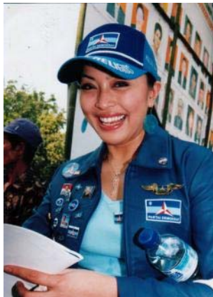
Angelina Sondakh on the campaign trail that put her into the Parliament.