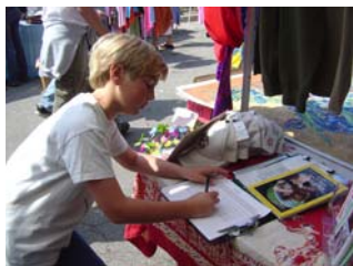
Petition being signed at Farmer’s Market in Santa Monica by a young supporter.

If you haven’t signed the petition, please do so. If you have signed it, find one or two more people and ask them to sign it after explaining what we are trying to accomplish. The online petition can be found at: www.petitionthem.com/default.asp?sect=detail&pet=1652