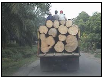
Durian logs being transported along a road from Medan to Bukit Lawang.