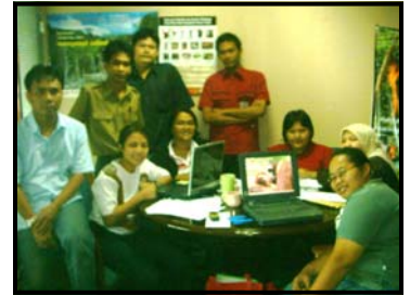
Founding members of the Indonesian Orangutan Caring Club meet at the OUREI Jakarta office to discuss their 2006 goals (January 3, 2006).

Contact OUREI for more information about IOCC and how you can help.